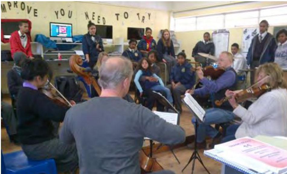
Arianna String Quartet performing for music learners