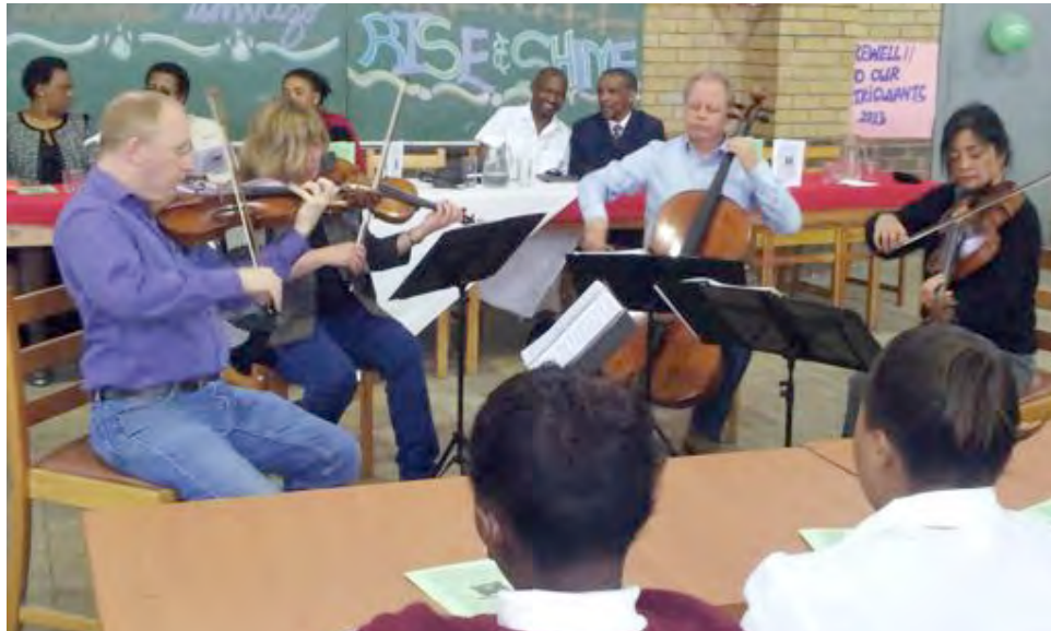
SCHOOLS OUTREACH CONCERT: PHANDULWAZI HIGH SCHOOL, Lower Crossroads