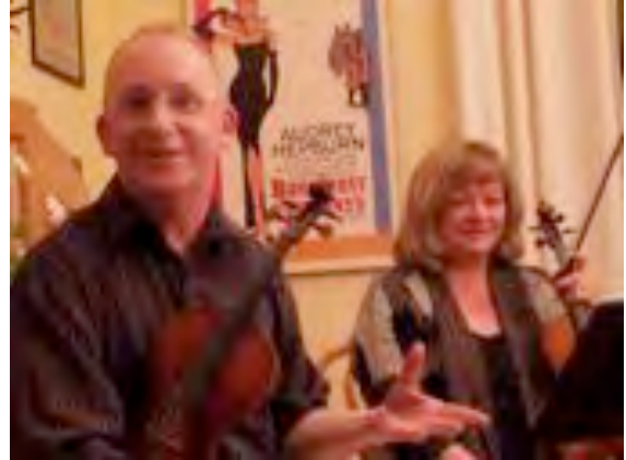
PERFORMANCE AT VERONA LODGE, THREE ANCHOR BAY