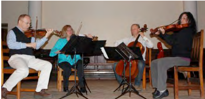
Arianna String Quartet (ASQ)