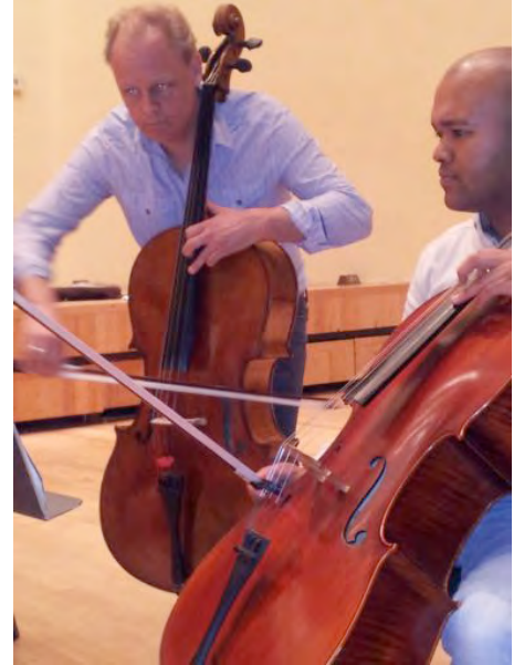
K L R T B A L L E V I N