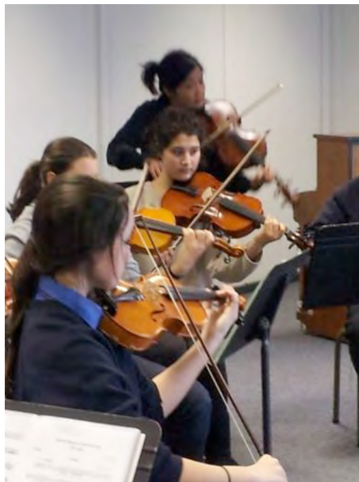
THE ARIANNA STRING QUARTET IN ACTION