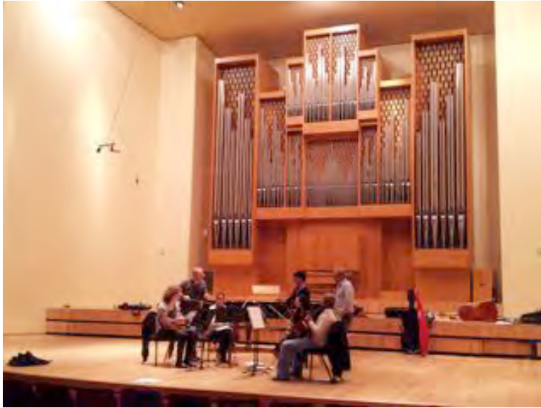
MASTERCLASS : University of Stellenbosch String Quartet at the Ender Hall, Stellenbosch.